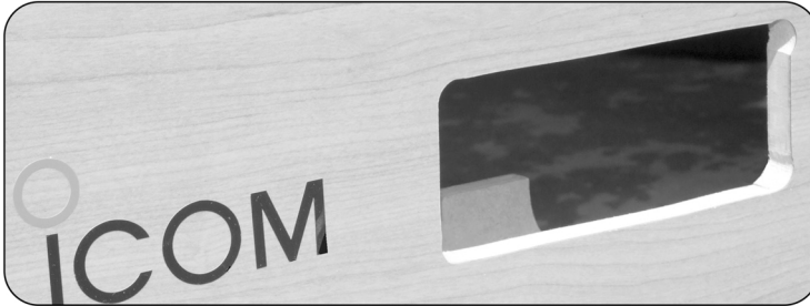
Step 1 - Cut hole in panel to size using dimensions supplied