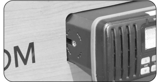
Step 2 - Insert radio through fitting hole