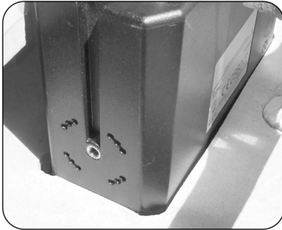
Step 3 - Shows rear of radio, ready to be fitted with Mount.002