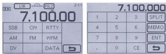
Tap A Operating Mode Selection