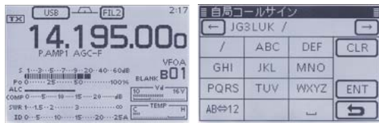
Tap C Showing Multi-Function Meter