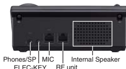
Controller Rear Panel view

An external speaker and electronic keyer can be connected to the controller.