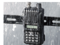
Water Resistance test