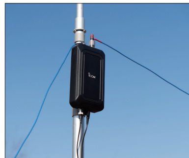
Wire antenna installation example